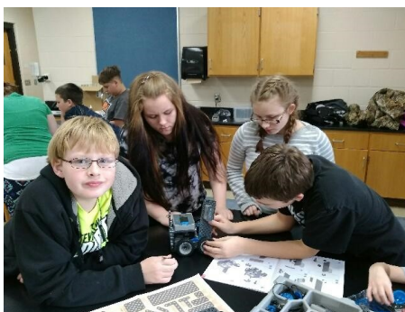
The 4-H After-School Robotics Club in Iosco County received a $1,000 Michigan 4-H Legacy Grant to use VEX Robotics as a tool to help club members develop life skills.

Save the date for 4-H Day at Michigan's Adventure